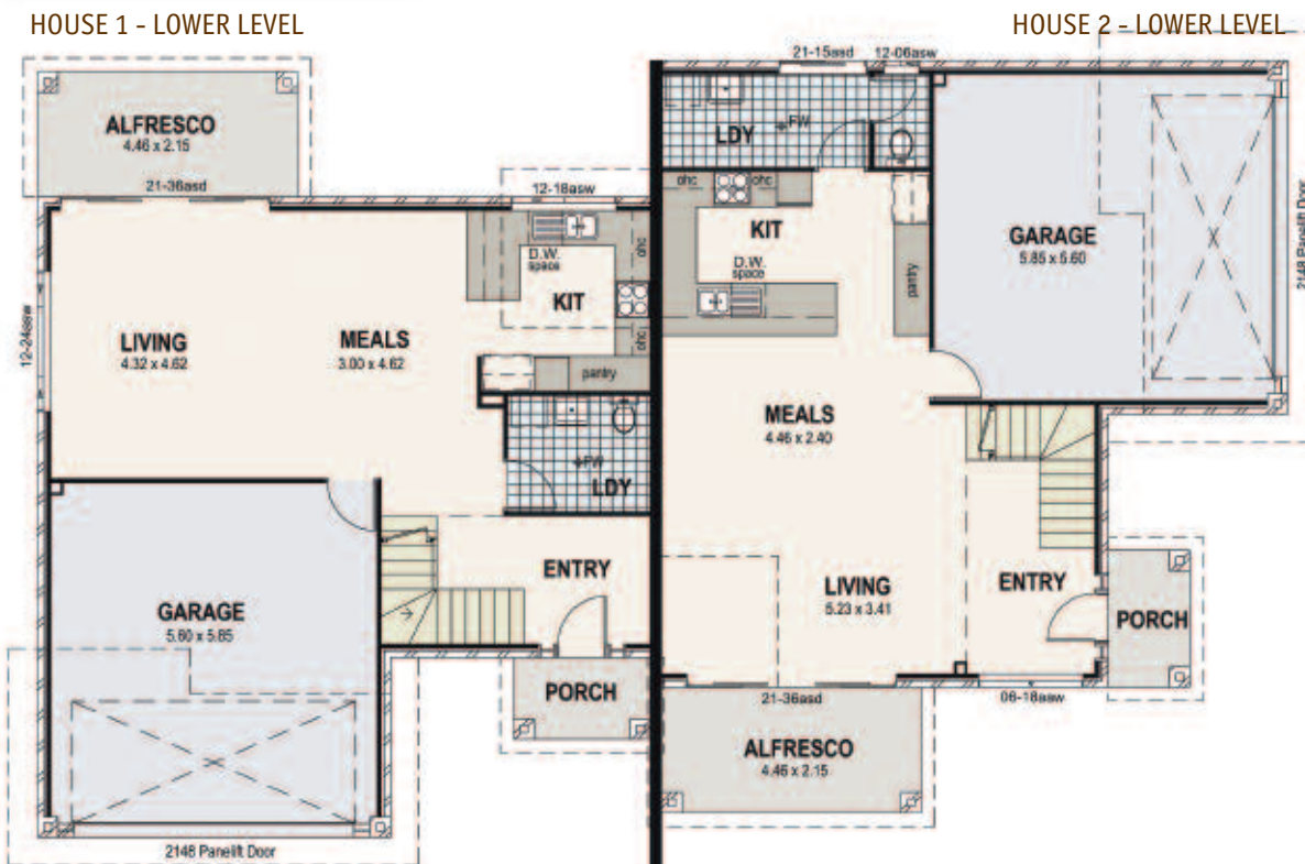
HOUSE 1 - LOWER LEVEL